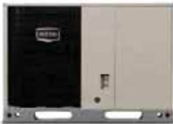
LARGE PACKAGED MODEL

Select products feature a two-stage technology which allows your packaged air conditioner or heat pump to operate at the most efficient level for total indoor comfort regardless of the outside temperature.