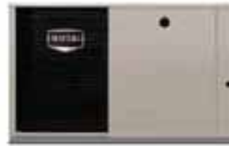
SMALL PACKAGED MODEL