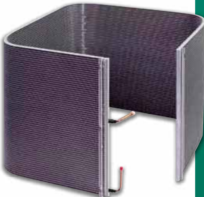
All-aluminum Micro-Channel technology to prevent corrosion.