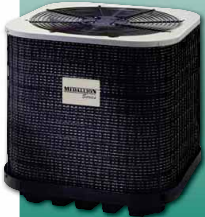
Model NS6(Q,B)D Air Conditioner