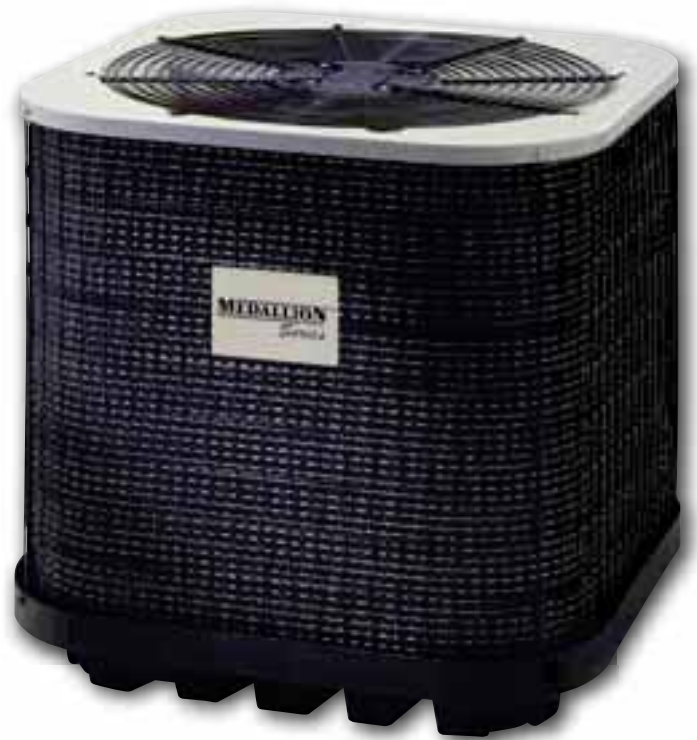
Model NT4(Q,B)D Heat Pump