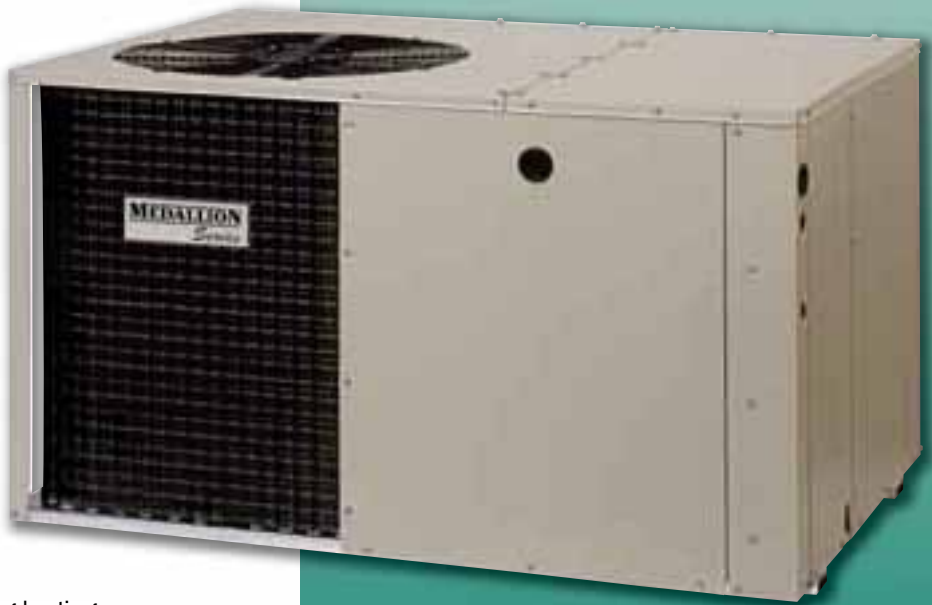
Models P7RD Air Conditioner, Q7RD (7.7 HSPF) Heat Pump