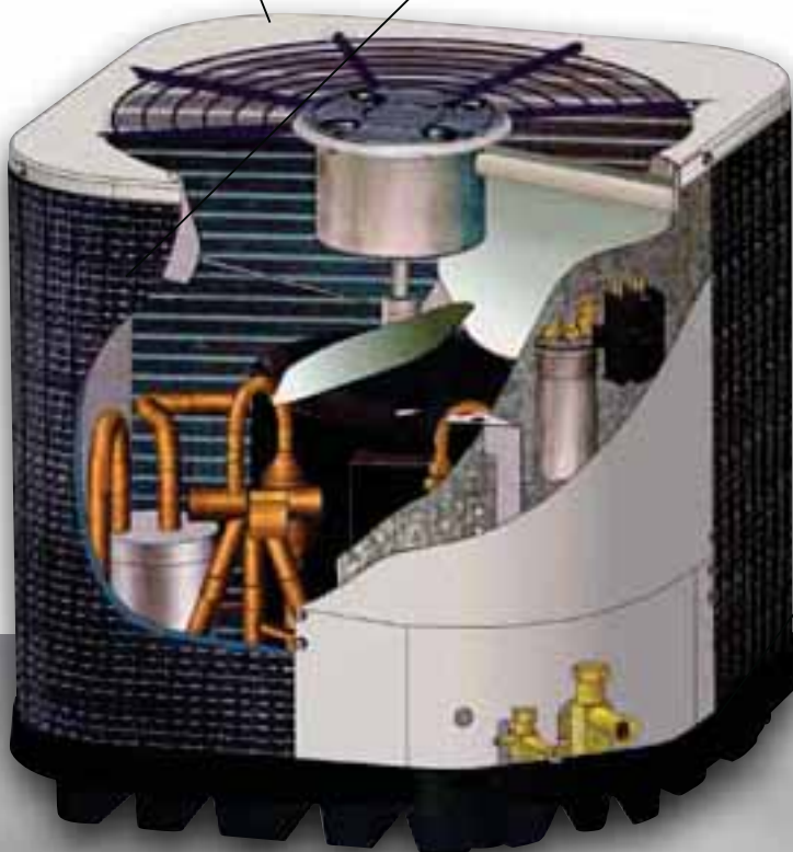
Model NT4BD Heat Pump cutaway view

Wire coil guard and plastic mesh hail guard