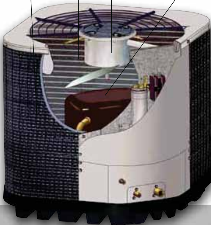
Model NS60D Air Conditioner cutaway view