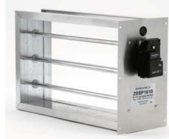
PCZDSP Side Mount