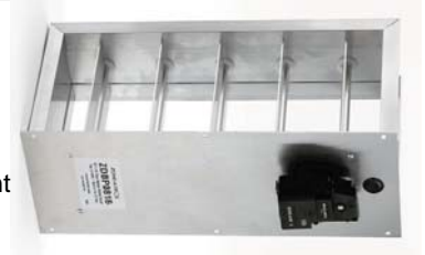
PCZDBP Bottom Mount