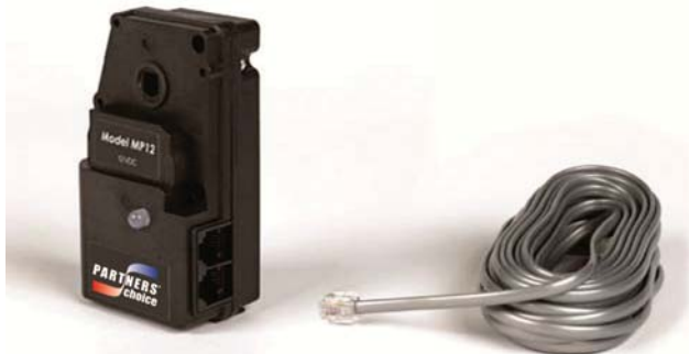
MP12 Plug-In Motor and Modular Cord included with damper.

The P suffix after the model PCZDS or PCZDB denotes that damper is operated by the exclusive Plug-In Damper Motor. The 12VDC motor, powers the damper both closed and open. The energy saving motor, Model MP12, draws less than 1VA for the few seconds it takes to operate. The motor features an internal switch that removes power to the motor when in the Open and Closed position providing extra long life. The MP12 motor has been life tested to over 1,000,000 cycles.