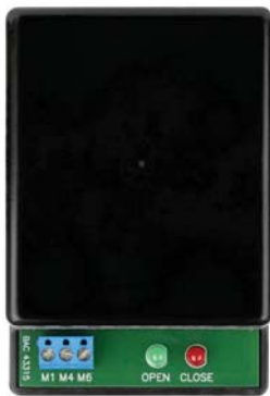
Model MDM Motor with Position LEDs.

The PCRDM is available in 5”, 6”, 7”, 8”, 9”, 10”, 12”, 14”, 16”, 18” and 20” diameters.