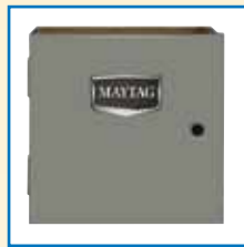
Zone Control Panel