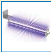
UV Air Treatment System