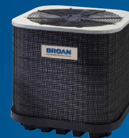
13-14 SEER Split Systems

be ideal for your family. Heat pumps work similar to a conventional air conditioner with one big exception; they also provide heat in the winter. The heat pump is designed to work best in environments where the temperatures do not drop below freezing. If this describes your region then you can save 30 to 60% on energy usage during the winter months by switching to a heat pump.