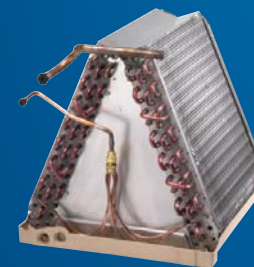
Uncased Indoor Coil