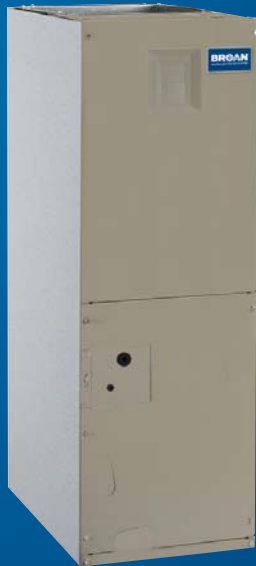
13-14 SEER Air Handler

The outdoor section features single-stage cooling technology and combines with our variable speed indoor section for improved cooling comfort over a standard HVAC system. Variable Speed indoor section improves humidity control and provides better indoor air quality by constantly mixing the air.