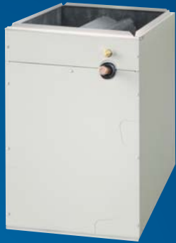
Cased Indoor Coil