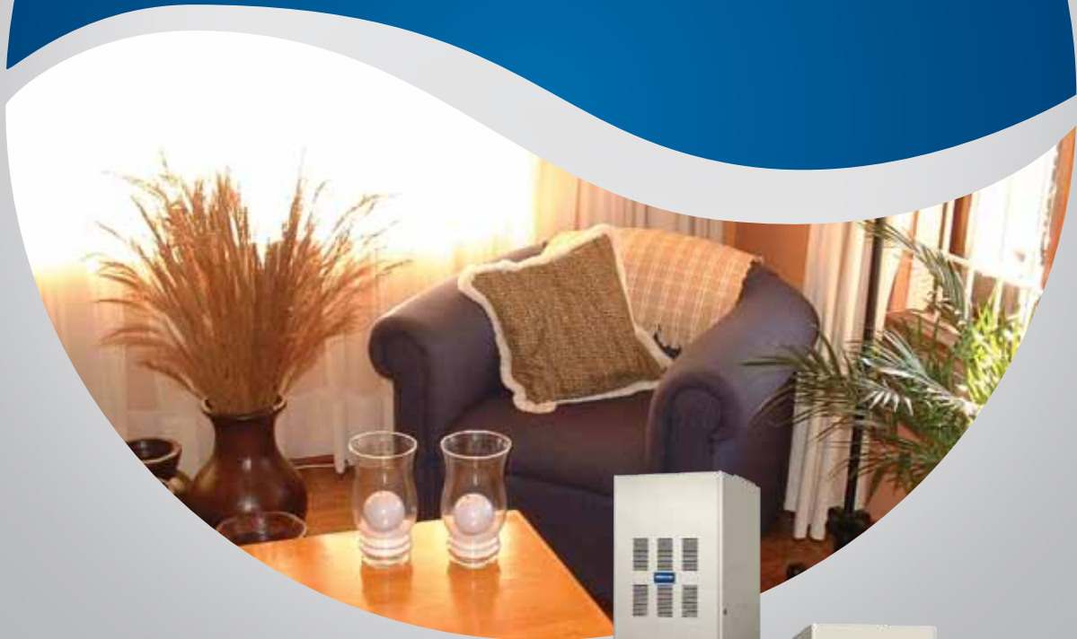
SINGLE-STAGE OIL FURNACES

Innovation, dependability and total comfort