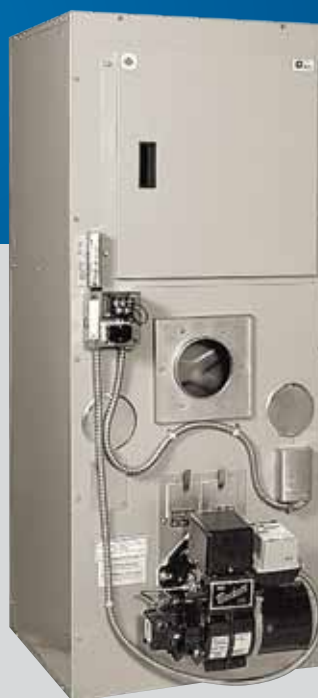
DOWNFLOW/HORIZONTAL WITH VESTIBLE