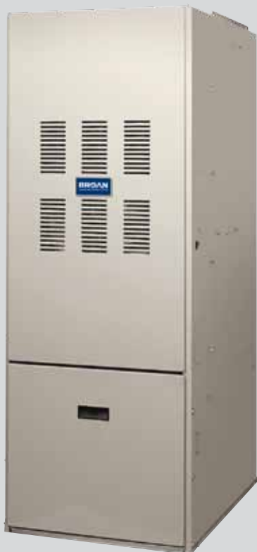
HIGH BOY/FIXED- AND VARIABLE-SPEED