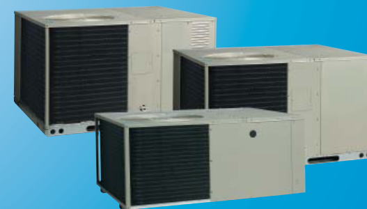
Packaged Air Conditioners, Packaged Heat Pumps and Gas Electric Packs

Specifications and illustrations subject to change without notice and without incurring obligation.